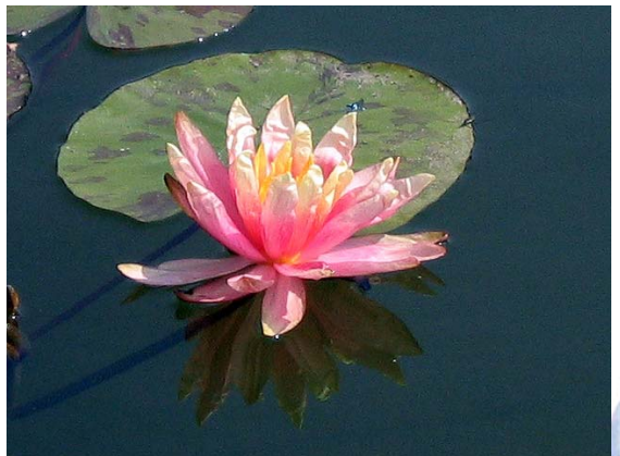
Nymphaea 'Georgia Peach'