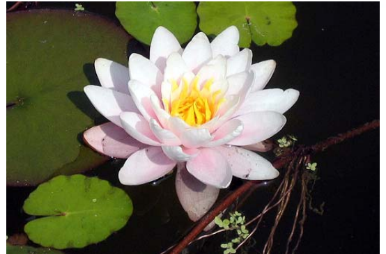
Nymphaea 'Mariacea Albida'

Scirpus albescens – Vertically striped variegated grass